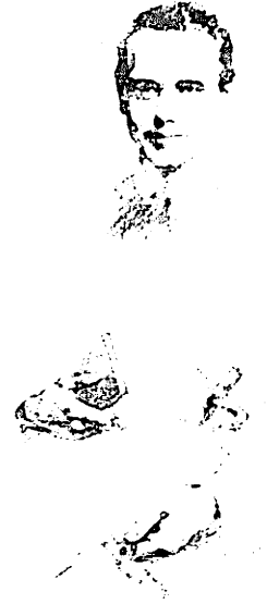
Father Francis Xavier Seelos

To order, call 800-325-9521 www.liguori.org